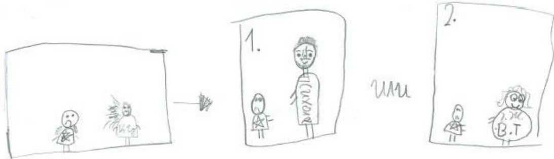
Какво да направя, ако някой е лош с мен ?

Children and families with whom the people working in the Organisation get in contact as part of their professional work shall be familiarised with this Policy.